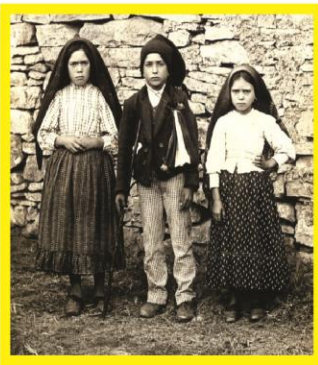
Lucia, Francisco & Jacinta - The Seers of Fatima