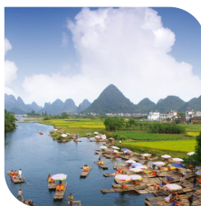
Guilin & Yangshuo, China

Home to the Li River, this area is spectacularly beautiful