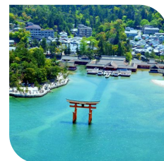
Hiroshima and Miyajima, Japan

Kyoto, Japan's former capital, is home to 17 UNESCO World Heritage sites