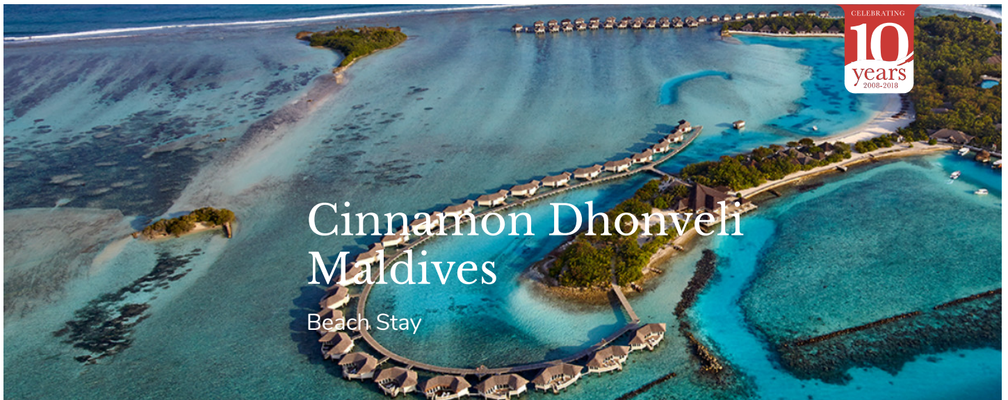
CINNAMON DHONVELI MALDIVES BEACH STAY